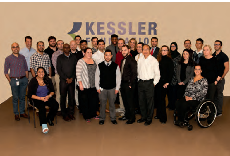
Kessler Foundation's Human Performance and Engineering Research team