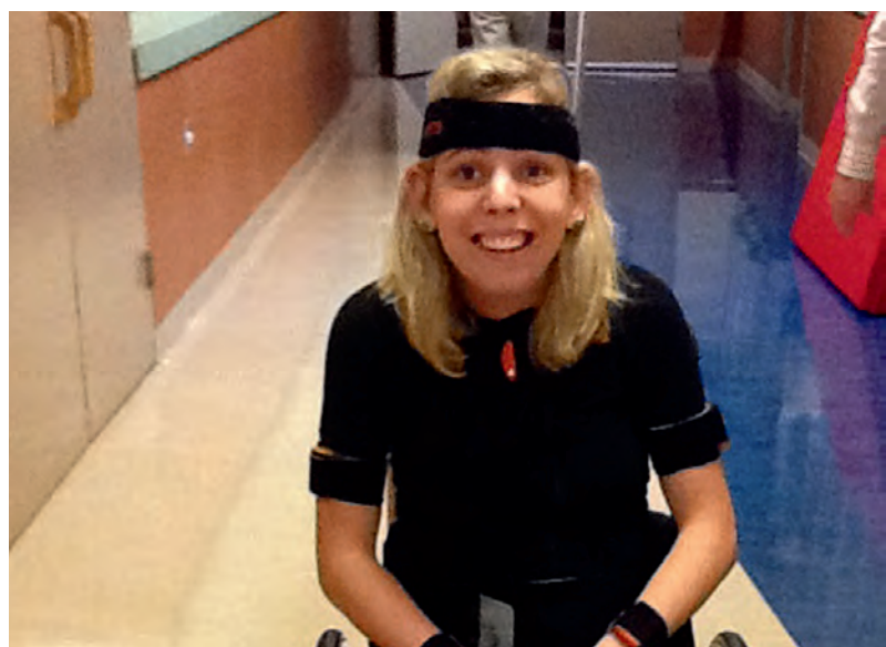
Researchers are studying ways to lessen the stresses for young wheelchair users.